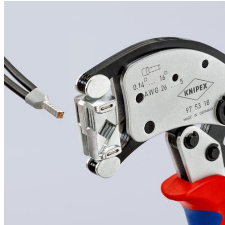
Uniquely flexible: connectors can be inserted in the rotatable crimp head from almost any position