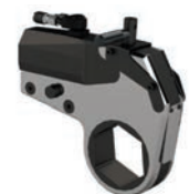
Handle kits for TWH430N