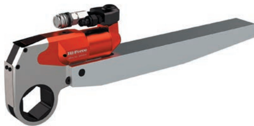
TWH-N fitted with extended reaction arm