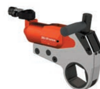
Handle kits for TWH27N, TWH54N, TWH120N & TWH210N