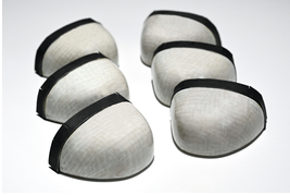
Composite toe cap